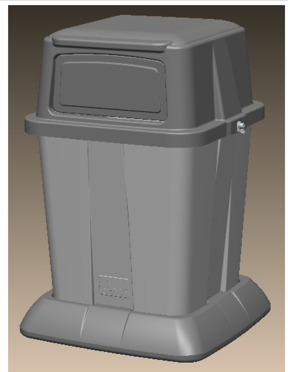
GRAY COLOR, OPTIONAL BASE, DOORS AND PUSH-BUTTON LOCK FOR ILLUSTRATION ONLY