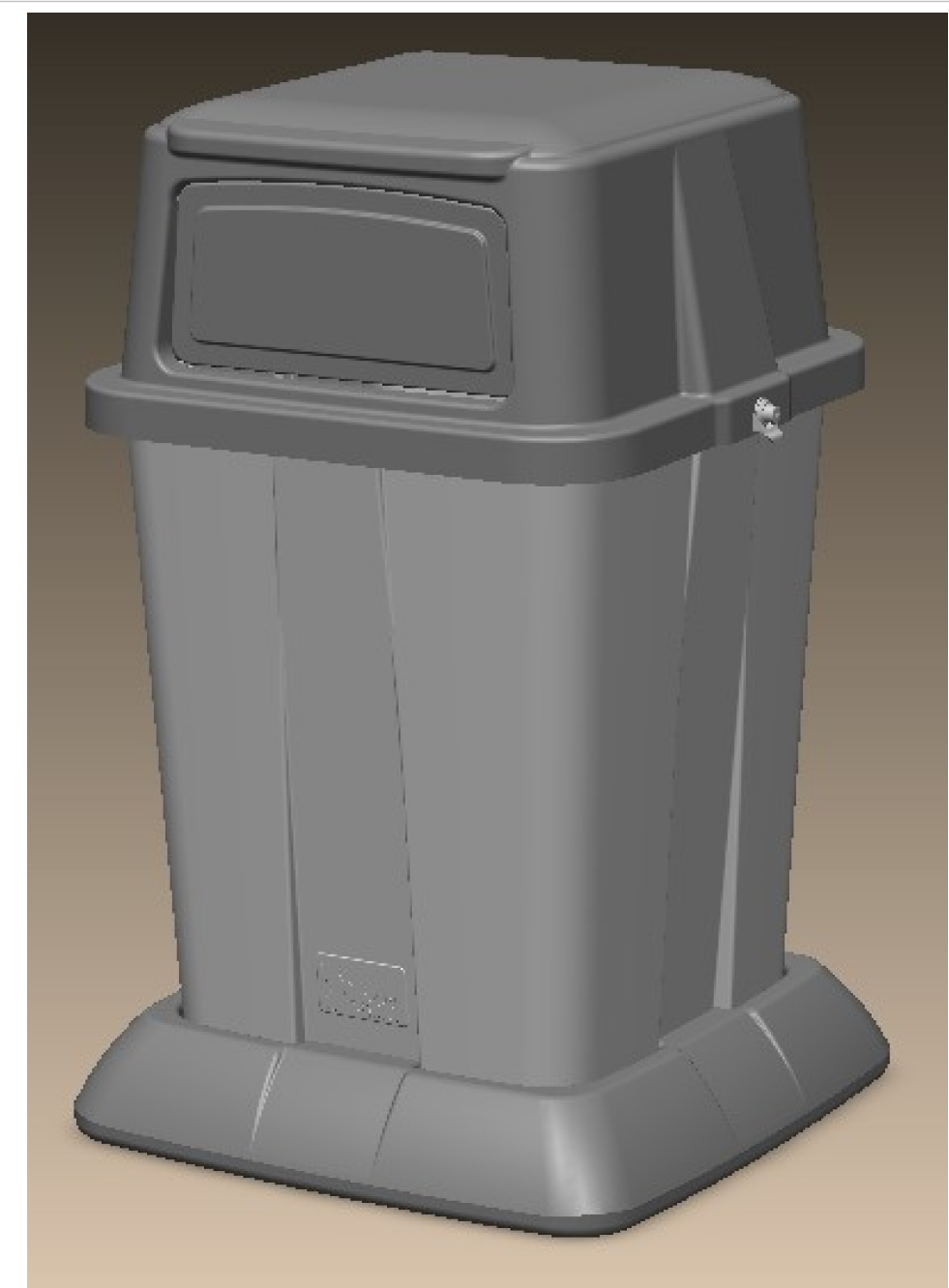
GRAY COLOR, OPTIONAL BASE, DOORS AND PUSH-BUTTON LOCK FOR ILLUSTRATION ONLY